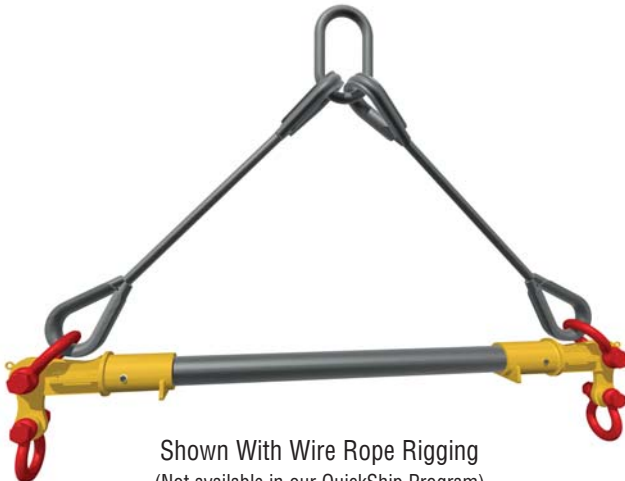
Shown With Wire Rope Rigging (Not available in our QuickShip Program)